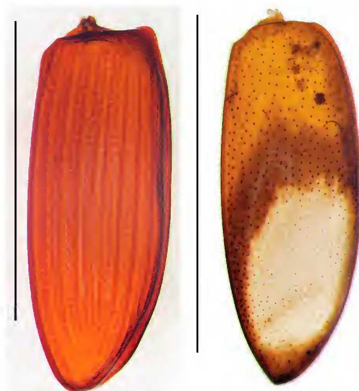
Figure 5: Elytra of beetles: Lycidae family (left), Chrysomelidae family (right). Identification by I.A. Zabaluev.